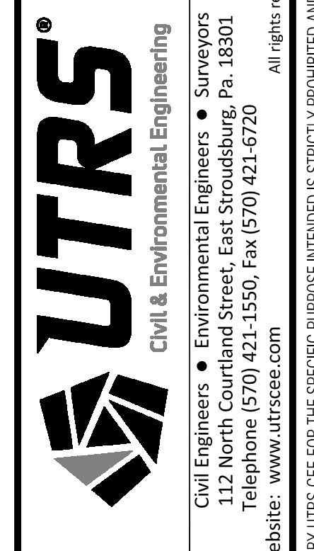
EXHIBIT B - BCRA WATER SERVICE AREA SERVED VIA INTERMUNICIPAL AGREEMENT INTERMUNICIPAL WATER SERVICE AGREEMENT AND FACILITIES TRANSFER AGREEMENT BETWEEN THE BOROUGH OF EAST STROUDSBURG AND BROOKHEAD CREEK REGIONAL AUTHORITY BROOKHEAD CREEK REGIONAL AUTHORITY 410 MILL CREEK ROAD EAST STROUDSBURG, PA 18301 MONROE COUNTY, PA