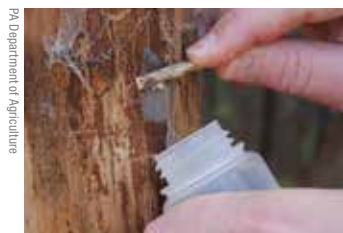
Figure 3. Scraping SLF egg masses from a tree.