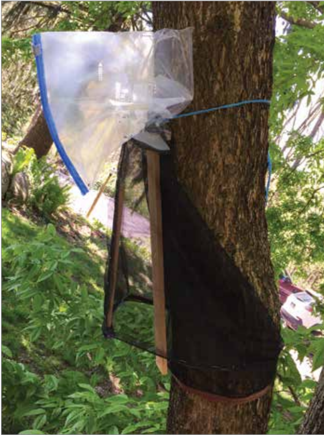
Figure 5. A funnel-style trap wrapped around a tree to capture SLF.

about trapping SLF in “Using Traps for Spotted Lanternfly Management” at extension.psu.edu/using-traps-for-spotted-lanternfly-management . Check and change traps at least every other week (or more often in highly infested areas). Be aware that this method may not reduce the number of nymph or adult SLF you see later in the year.