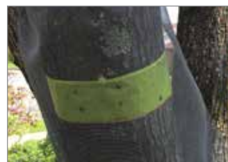
Figure 4. A banded tree covered in chicken wire to prevent mammal and bird bycatch.

any tree, but we recommend only banding trees where SLF is abundant. You can use either sticky bands or a funnel-style trap. Sticky bands may be purchased online or from your local garden center. Push pins can be used to secure the band. While some bands may catch adults, banding trees is most effective for nymphs. Be advised that birds and small mammals stuck to the bands have been reported. To avoid this, you should cage your sticky bands in wire or fencing material wrapped around the tree. Alternately, try reducing the width of the band, so that less surface area is exposed to birds and other mammals. Both of these methods will still capture SLF effectively. To eliminate the risk of catching birds and mammals, you can use funnel-style traps that consist of mesh wrapped around the tree that leads into a container to trap SLF (Figure 5). Some companies may be producing these traps commercially, or you could also make your own. The mesh (e.g., plastic netting) should be wrapped around the entire circumference of the tree and funnel into a container (e.g., inverted peanut butter jar or plastic bag) with a hole in the lid to allow SLF nymphs and adults to pass through. Read more