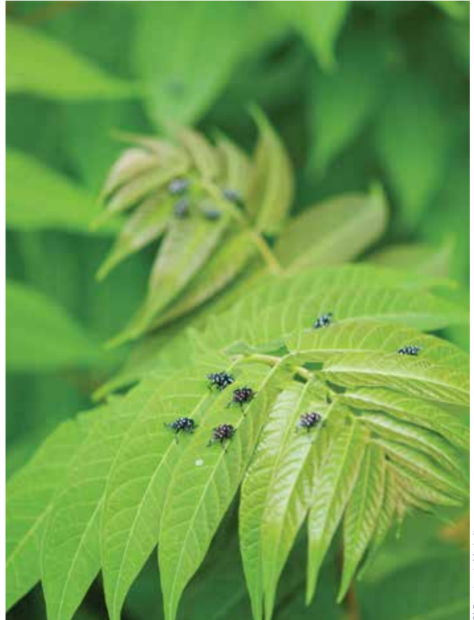
Figure 6. Early instar SLF feeding on the invasive plant tree-of-heaven.

Use recommended methods to apply herbicide to the tree from July to September and wait at least 30 days before