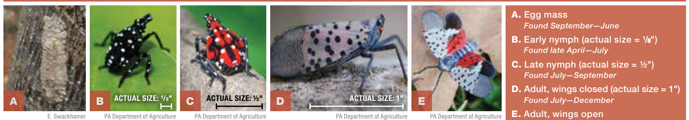
Figure 1. The life stages of SLF, including an egg mass on a tree.

and are active until winter. This is the most obvious and easily detectable stage because they are large (~1 inch) and highly mobile. Adults have black bodies with brightly colored wings.